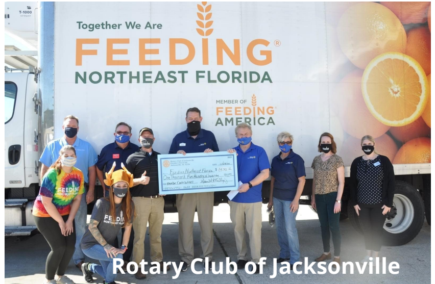
Rotary Club of Jacksonville 4661 Pounds of Food Feeding Northeast Florida