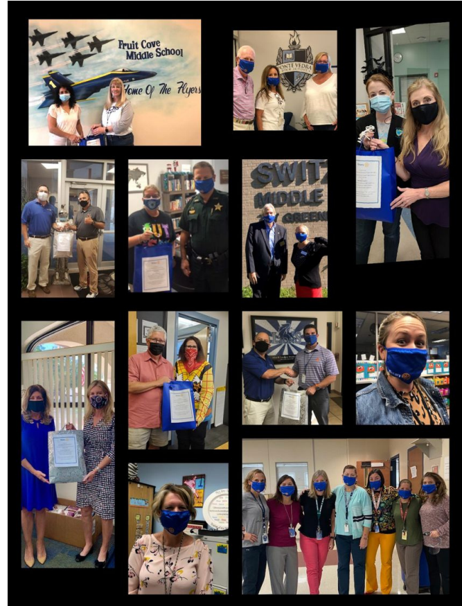
St. Johns County schools welcomed our Rotary gift of over 2,700 masks for teachers and staff for 25 schools #ServiceAboveSelf #SJCS #COVID19 #MakeSchoolsSafe