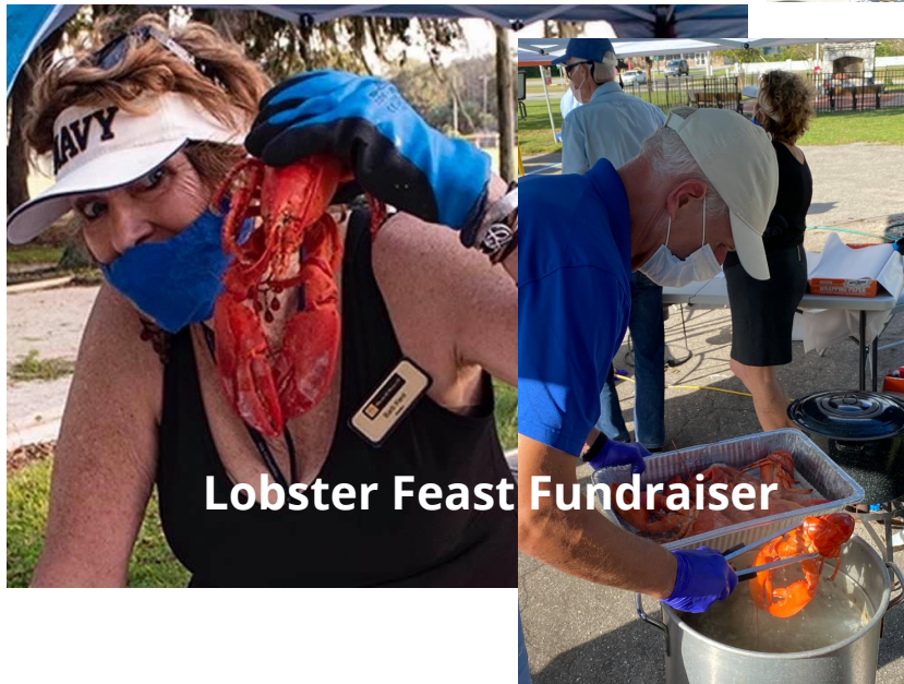
Lobster Feast Fundraiser