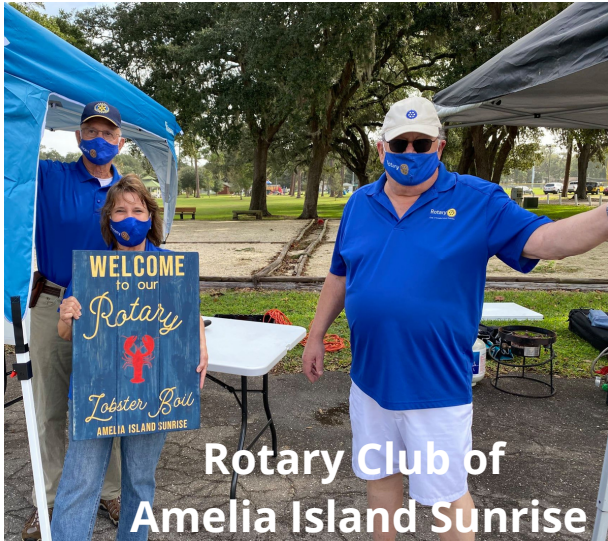
Rotary Club of Amelia Island Sunrise