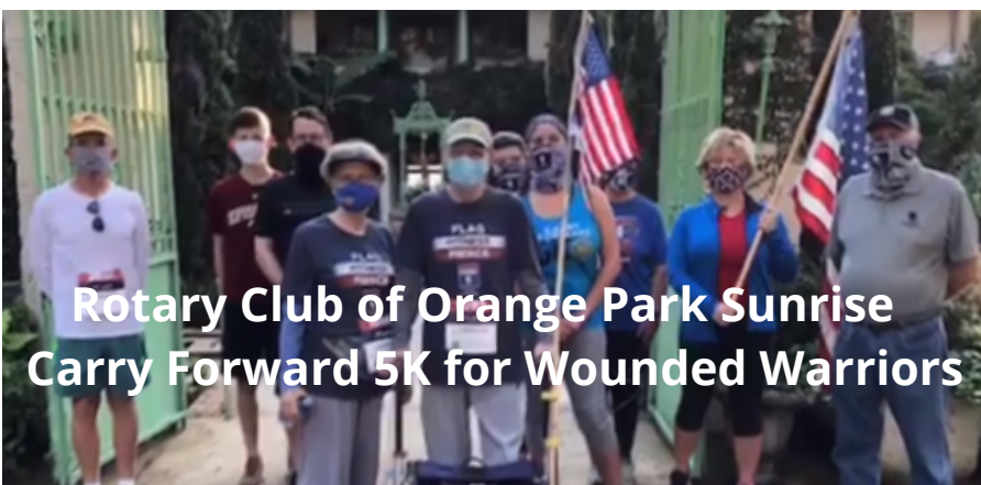
Rotary Club of Orange Park Sunrise Carry Forward 5K for Wounded Warriors