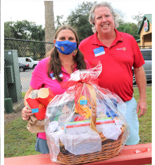
DeLand Masters Mini Golf Tournament Raffle Winnings for New Turnbull Grandbaby