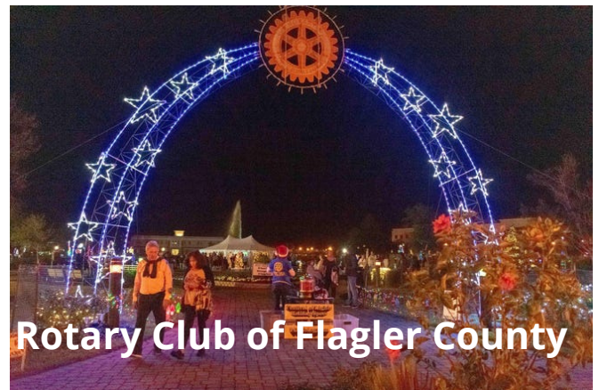
Rotary Club of Flagler County