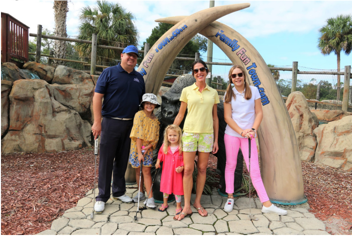
Rotary Club of DeLand