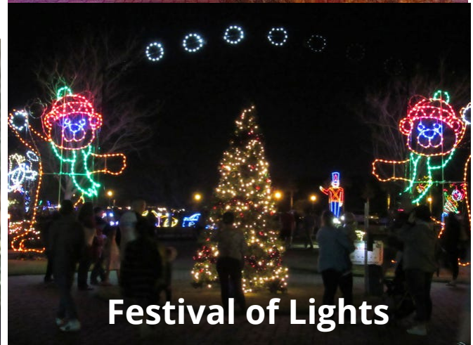
Festival of Lights