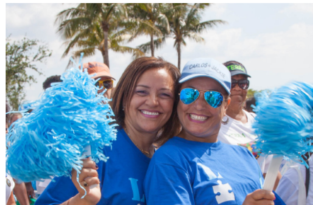
Rotary Club of Ponte Vedra Raises $3800 at Autism Speaks Walk