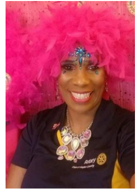
Lady Flamingo News

What this year means for me, and the ask I have for each of you, is to help make sure Rotary Opens Opportunities. Only by remaining committed to our Rotary Ideals, embodied by the Four-Way Test, can we face the challenges of today's world, embrace change, and find alternate ways to take advantage of